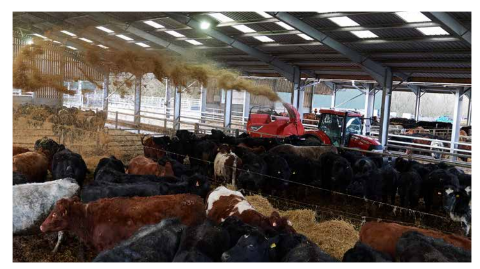
The Kverneland 864 is loaded with features that lets you do more, with less effort and in less time. It has grown its dimensions in all aspects with a massive 4.2m³ chamber size and is a full feature bale chopper. The Kverneland 864 handles 2.1m diameter round bales and is the ideal bale chopper for bedding and feeding applications. Its' longer body design provides even better support and stability for large square bales.