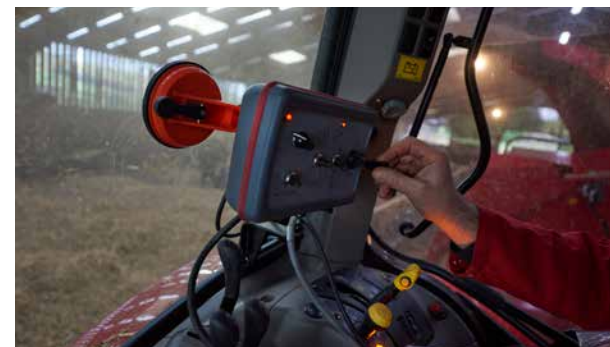
The 4-stage swivel chute is operated by the intuitive controlbox joystick.

On top of the control terminal located inside the tractor cab, the Kverneland bale choppers are equipped with an additional remote controlled switch for the floor chain and tailgate (optional for 852 and 856 Pro).