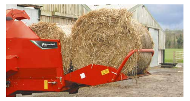
Foldable bale retaining kit.