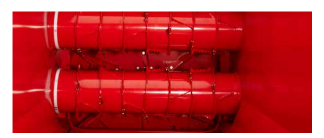
Two drum solution designed to handle large volumes of material.