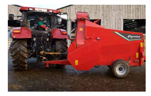
An extended drawbar provides best possible maneuverability during operation. The extended drawbar ensures easier operation, especially when turning with larger tyred tractors.