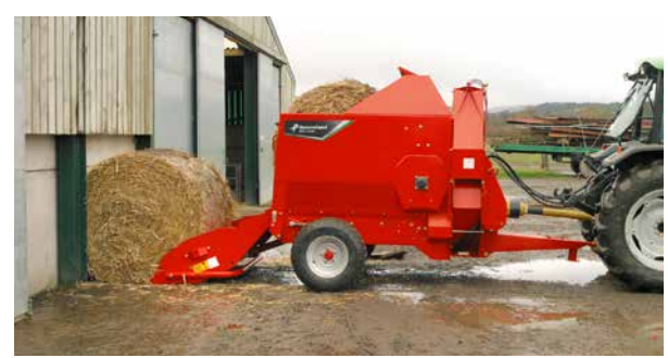
Easy self-loading of baled material.