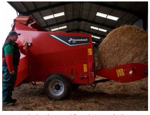
Operating both tailgate and floor chain in safe distance from the moving parts, by using the remote control placed on the side of chamber.

The tailgate offers the ability to carry a second round bale for increased capacity. Total lift capacity of the rear door is 1200kg. A foldable bale retaining kit can be fitted to the end of the tailgate to ensure that the bales stay in position during operation.