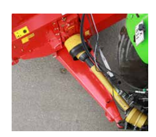
Long drawbar and wide angle PTO for improved turning with larger tyred tractors is standard.