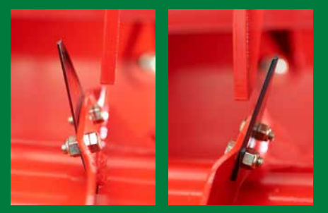
A Kverneland patented system the knives pass the fixed comb on alternative sides for a more even cut.