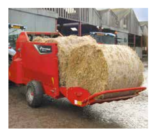
Kverneland 856 Pro will take 3 round bales for maximum capacity.