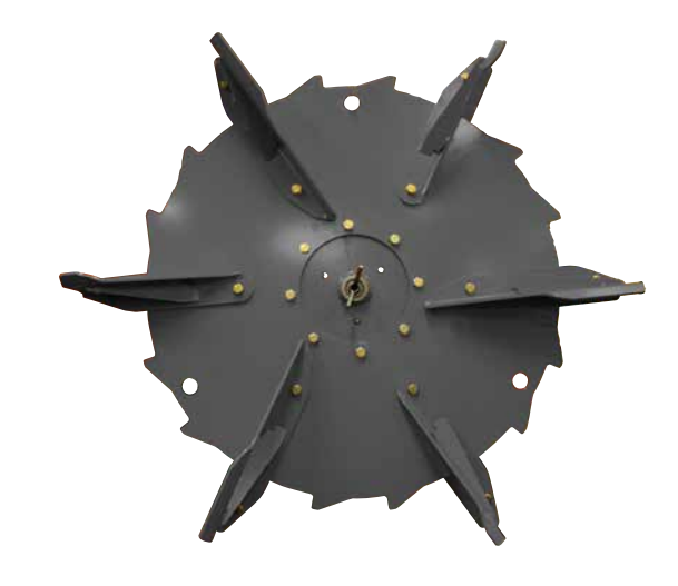
Extended paddles on the flywheel increase blowing distance and performance significantly. Bolt-on paddles ensure easy replacement in case of damage.

A dedicated flywheel configuration has been developed for the Kverneland 856 Pro. To maximise airflow the 1.55m diameter flywheel is fitted with 6 large front blower paddles. These paddles ensure optimum flow towards the chute for an extended blowing distance, as well as an excellent cleaning of the flywheel housing. Additionally the flywheel features 3 main paddles for an increased intake of material from chamber to flywheel. The flywheel does not chop the straw, thus ensures virtual full length material suitable for bedding of covered yard areas.