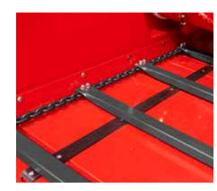
UltraGlide strips reduce wear to a minimum. (optional for 852).