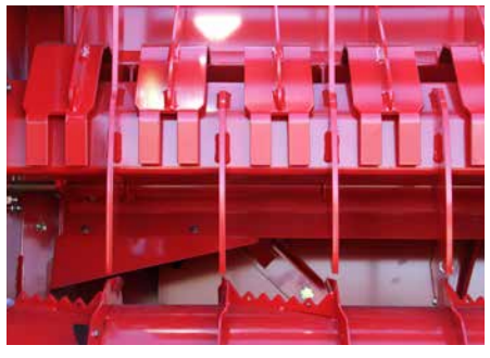
DFCS disengaged for maximum flow through the flywheel.