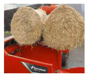
Easy access when loading from the top.